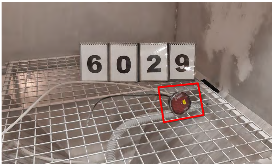
Photography 3: Sample 6029.7 – LED Lamp type FT-400 (marked with red line) during the IP5X test