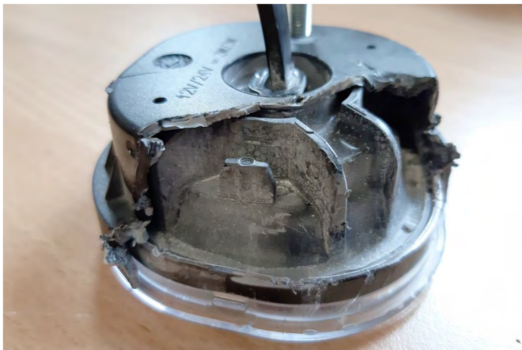
Photography 4: Dust did penetrate into tested object, but it did not affect safety or interfere with the proper operation of the device.

Dust did penetrate into tested object, but it did not affect safety or interfere with the proper operation of the device. Functional test involving connection every LED section to power supply (12-24V DC) and lighting check – passed. Test result positive.