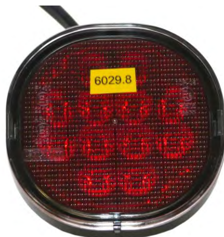
Photography 2: Sample 6029.8 – LED Lamp type FT-400 (to be tested on IPX8)