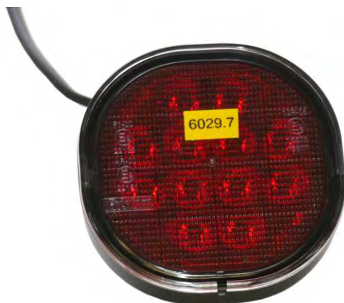
Photography 1: Sample 6029.7 – LED Lamp type FT-400 (to be tested on IP5X)