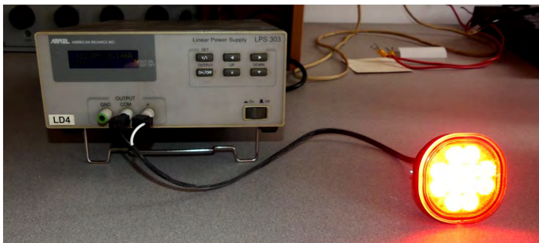
Photography 5: Sample 6029.8 – LED Lamp type FT-400 during functional test after IPX8 test